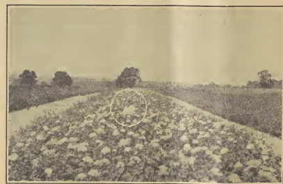
PLANT IN MASSES IN FRONT OF TALLER SHRUBS

HYDRANGEA ARB. GRANDIFLORA (Snowhill Hyd.)